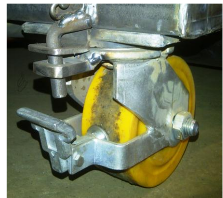
FLEX-TOWING – Swivel-Lock Caster Wide Crown Wheel Series-C4