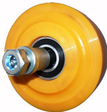
TOWING SERIES - 2.5" XHD Caster-C3 Polyurethane Wheel 3/4" Greaseless Axle