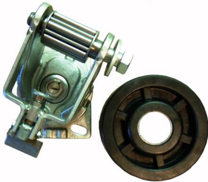
2" Standard Caster / Polyolefin Wheel 1/2" Axle with Roller Bearings-C1