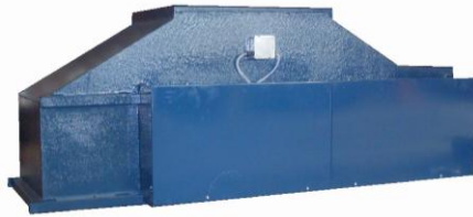
Diverter Flap RIBS plus Roxul Sound Dampening