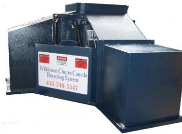
Diverter Flap TEFLON IMPACT Angle plus HD ROD with Foam Insulation