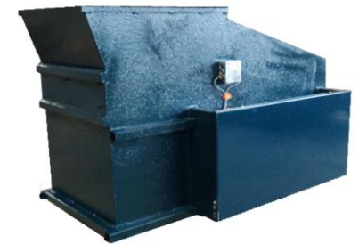
Diverter Flaps BOLD Centre Position with Flared Extension shown