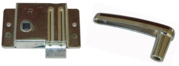
POSITIVE LATCH Handle Style - WHI DOOR DL - Series