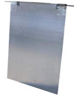
"Top Hinged - In-Swinging" FLAPS (Baffle) F Series