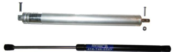
SELF CLOSING Cylinders Various Sizes C-series