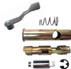
THUMB LATCH PARTS - ULc DOOR - "Below Handle" DL - Series